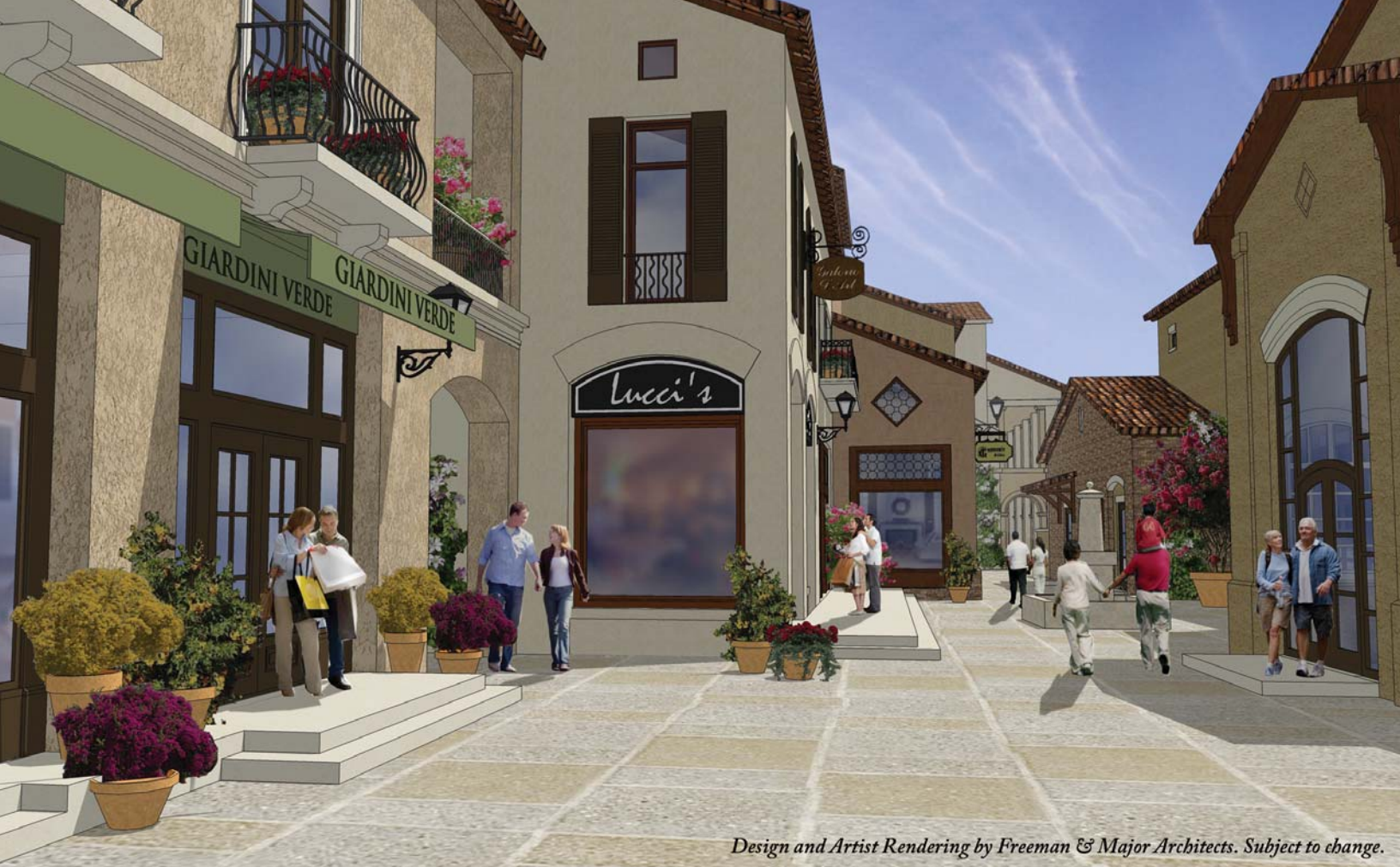
Design and Artist Rendering by Freeman & Major Architects. Subject to change.