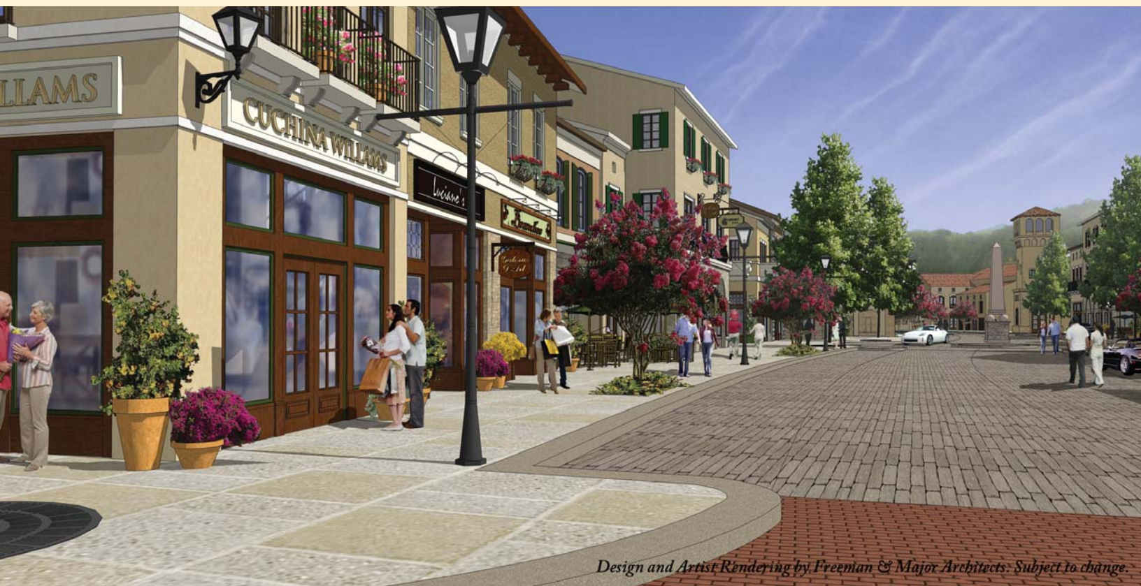
Design and Artist Rendering by Freeman & Major Architects. Subject to change.

Inspired by old-world European villages, the Village at Mountain Park will be an unparalleled place to work, shop, dine and visit.